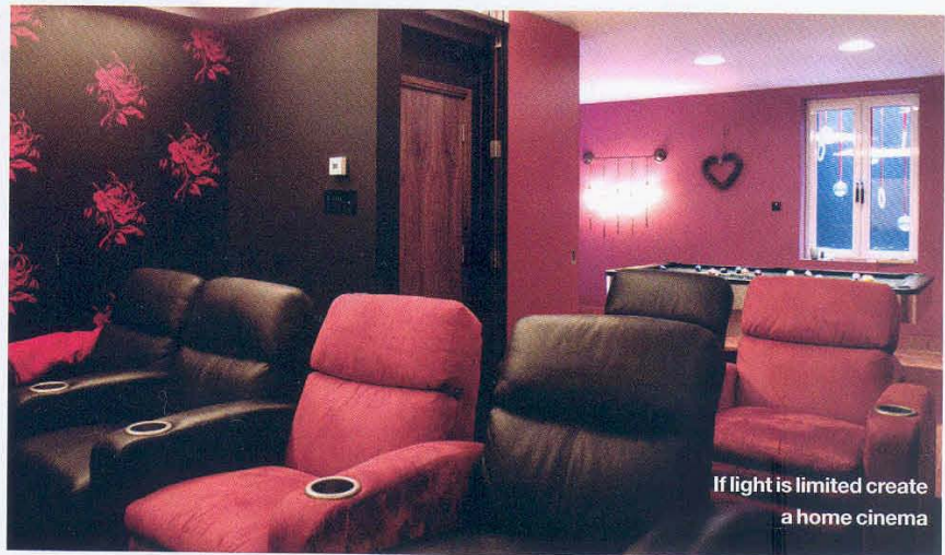
If light is limited create a home cinema