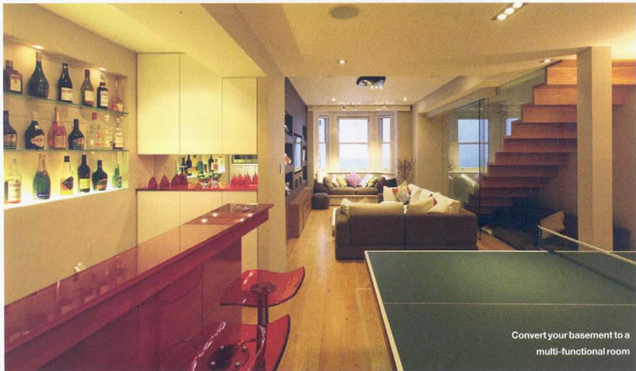
Convert your basement to a multi-functional room

Look no further than under your feet to extend your living space. The Green investigates improving your home with a basement conversion